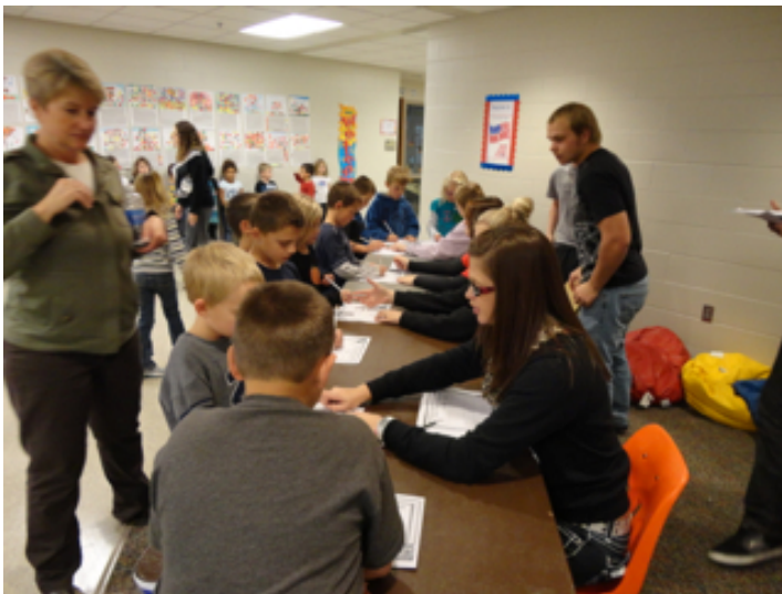
High school seniors prepare elementary students for the November election by having them register to vote.